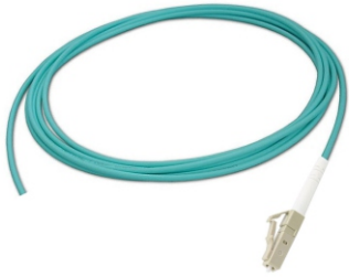
Fiber Optic Pigtail, OM4, LC-pigtail, 900 \mu m, LSZH, 2 m, aqua